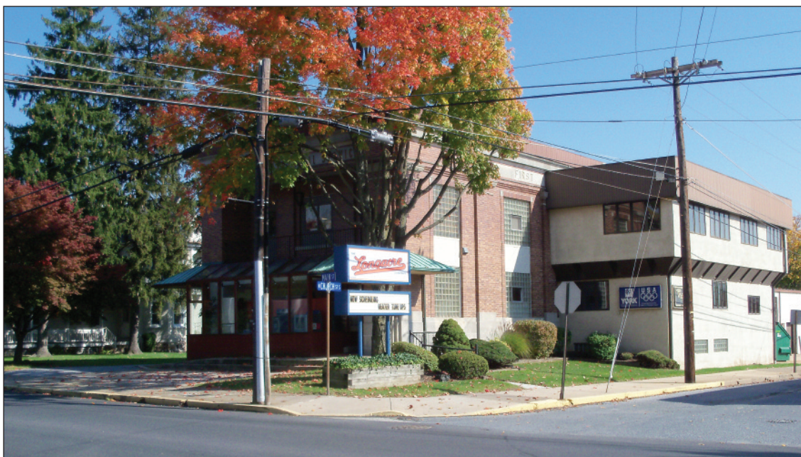
The Longacre Company headquarters at 602 Main Street in Bally.

Their showrooms feature a selection of appliances that rivals the big stores ... an impressive kitchen and bath design studio ... hardwood, ceramic tile, and carpet floor coverings ... and, of course, the Longacre professionals — a talented team with the experience to pull it all together. With a history spanning several generations, The Longacre Company is truly a unique source for a full range of services. They are committed to your complete satisfaction. You can count on The Longacre Company to deliver the finest service and materials — before, during, and after the sale. They bring an incredible wealth of experience to your residential projects, repairs, and maintenance.