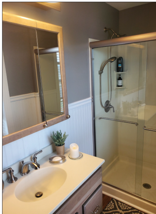
Bathroom Design / Remodeling

With one hundred years in the books, the Longacre Company looks forward to serving customers throughout the region for many years to come. The Longacre Company is located at 602 Main Street, Bally, PA 19503. For additional information, please call 610.845.2261 and visit www.longacreco.com .