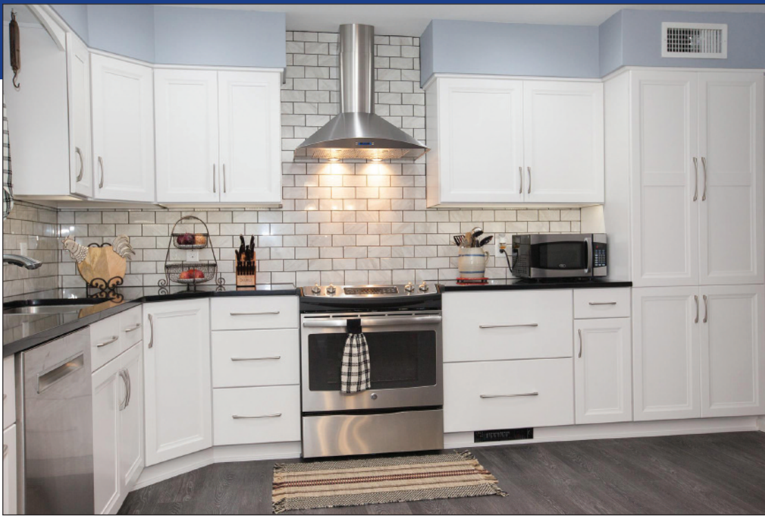
Kitchen Design / Remodeling