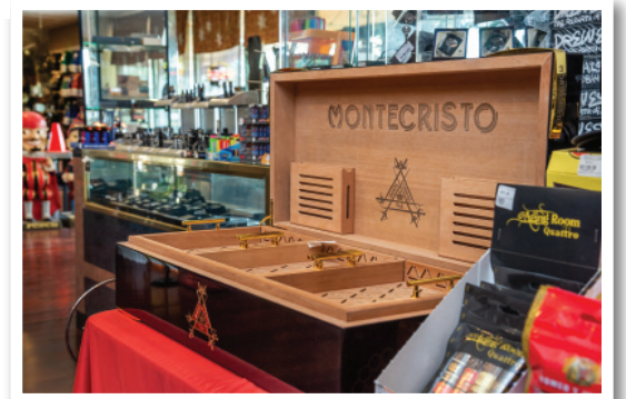
Montecristo Super Humidor

LOCATED AT 250 WEST RIDGE PIKE IN LIMERICK