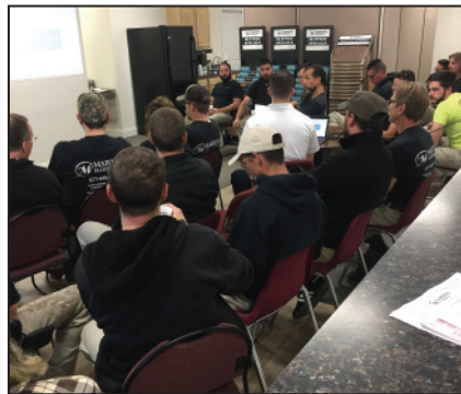
We are passionate about ongoing training for our installers.