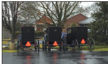
We still cater to a large segment of Amish and Mennonite customers in Fivepointville