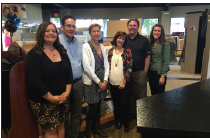
Wyomissing Sales Team