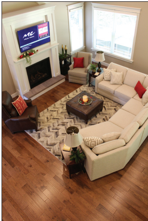
Best of Show in Lancaster Parade of Homes