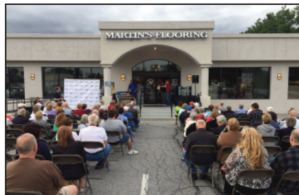
Outside event at the Wyomissing store