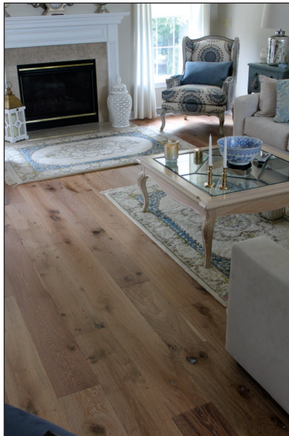
7 inch wide, wire brushed, whitewashed Hardwood