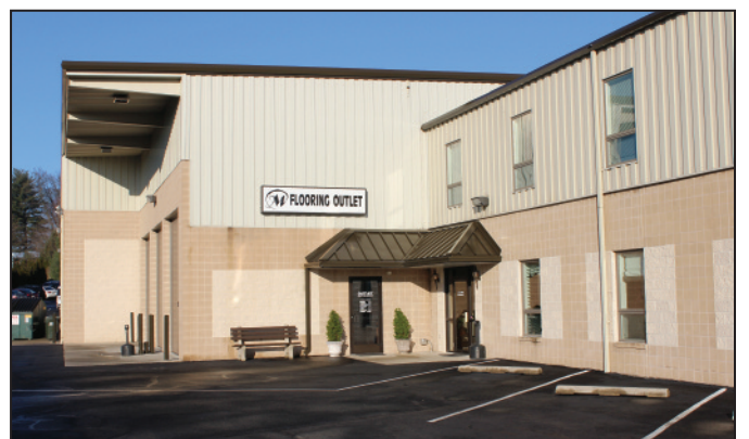
Martin's Flooring Outlet located behind the Fivepointville showroom.