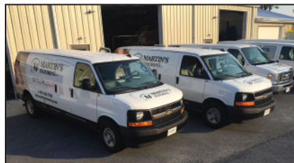
Not only training, but providing your team with new vehicles and tools is key.